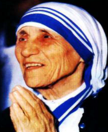
Feast Day Tue 5th Sept.